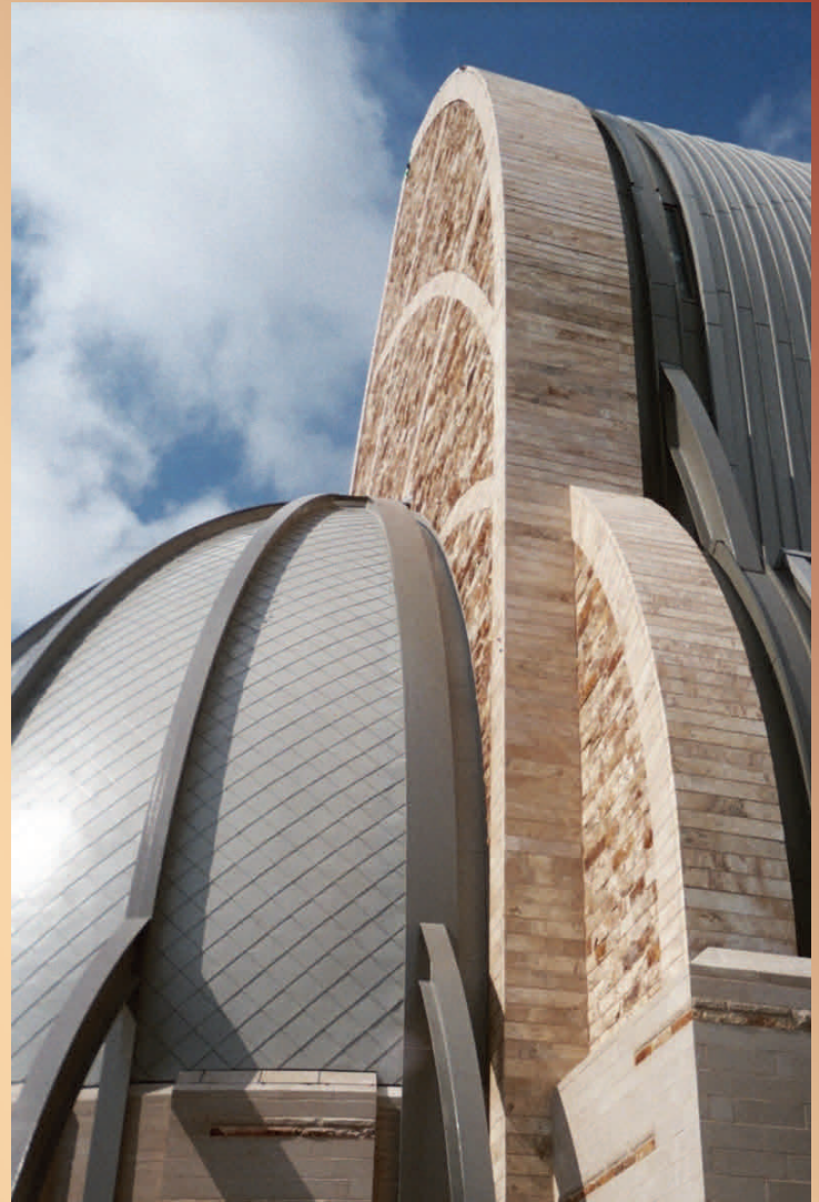
Ave Maria Oratory .040 prefinished aluminum